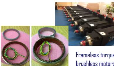
Frameless torque motors & ruggedised brushless motors

AJAX is the next generation Armoured Fighting Vehicle (AFV) for the British Army.